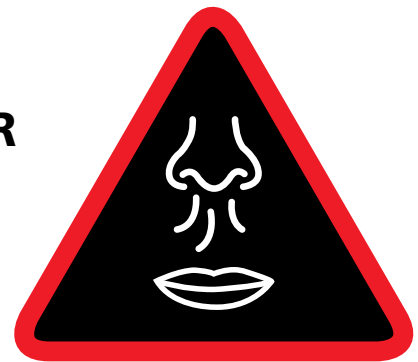
LOSS OF TASTE OR SMELL

▶ Self-isolate (including everyone in your group)