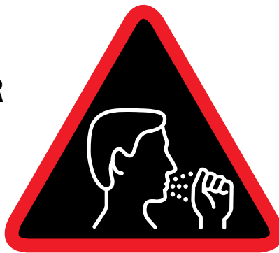
NEW CONTINUOUS COUGH